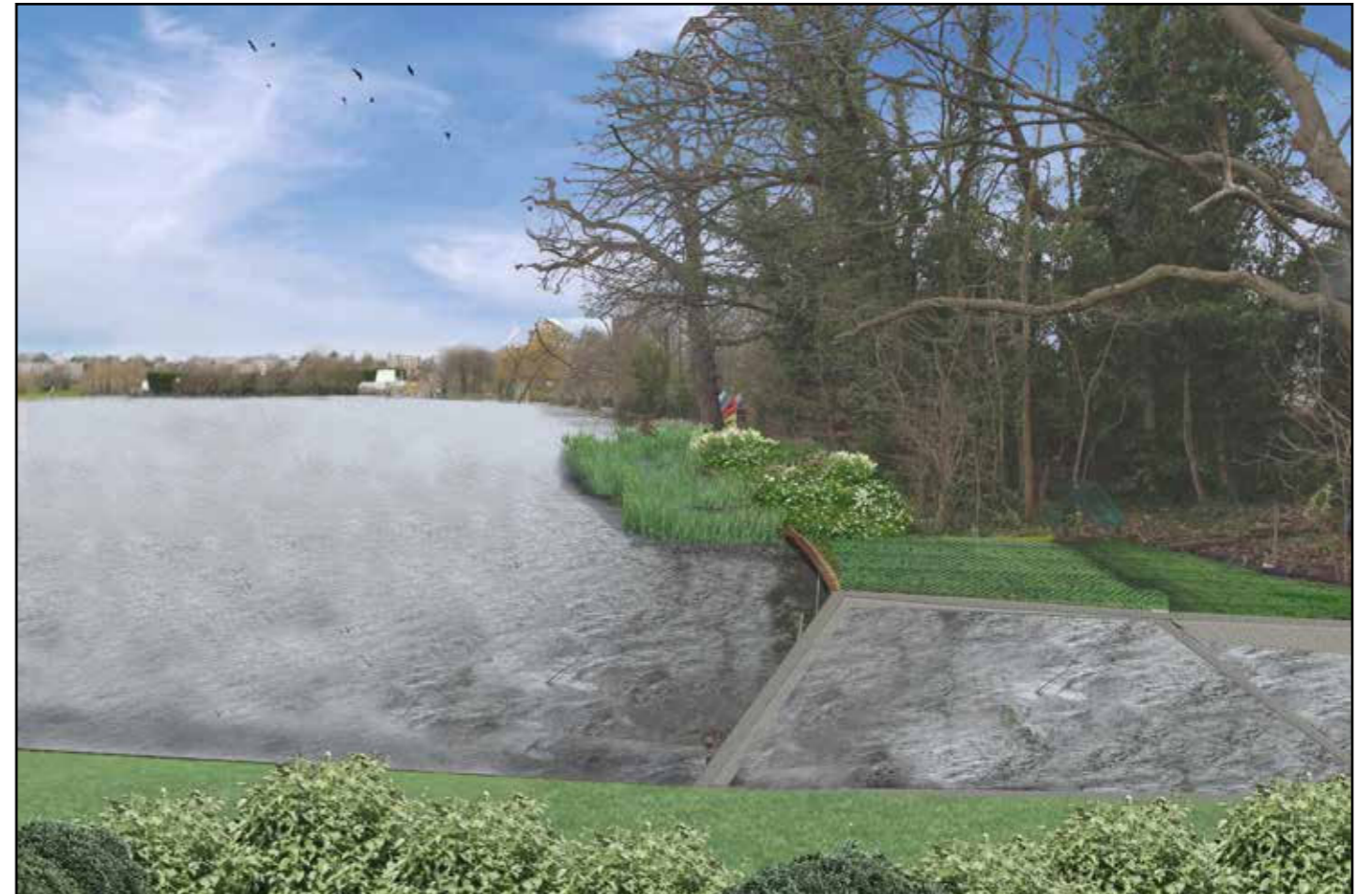
View 02: Proposed View