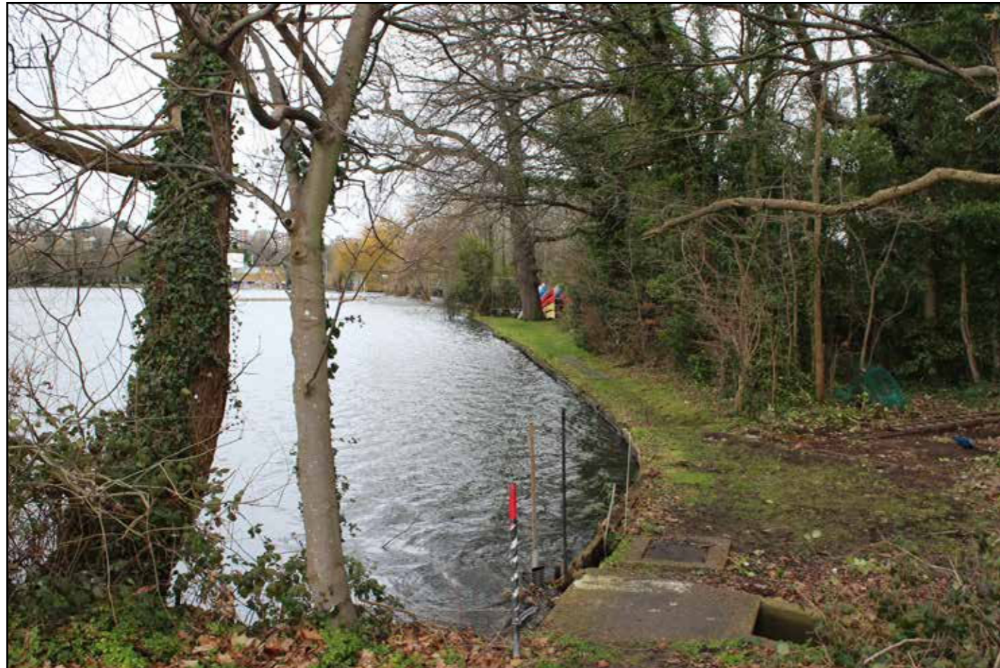
View 02: Existing View